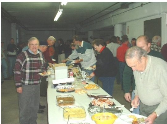
Retirees always eat first!